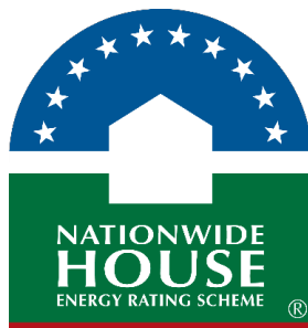
(b) Rating image