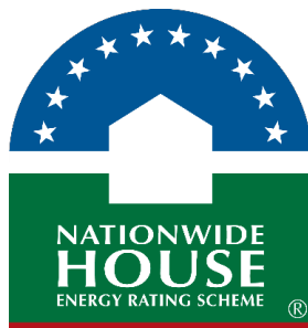
(a) Logo image