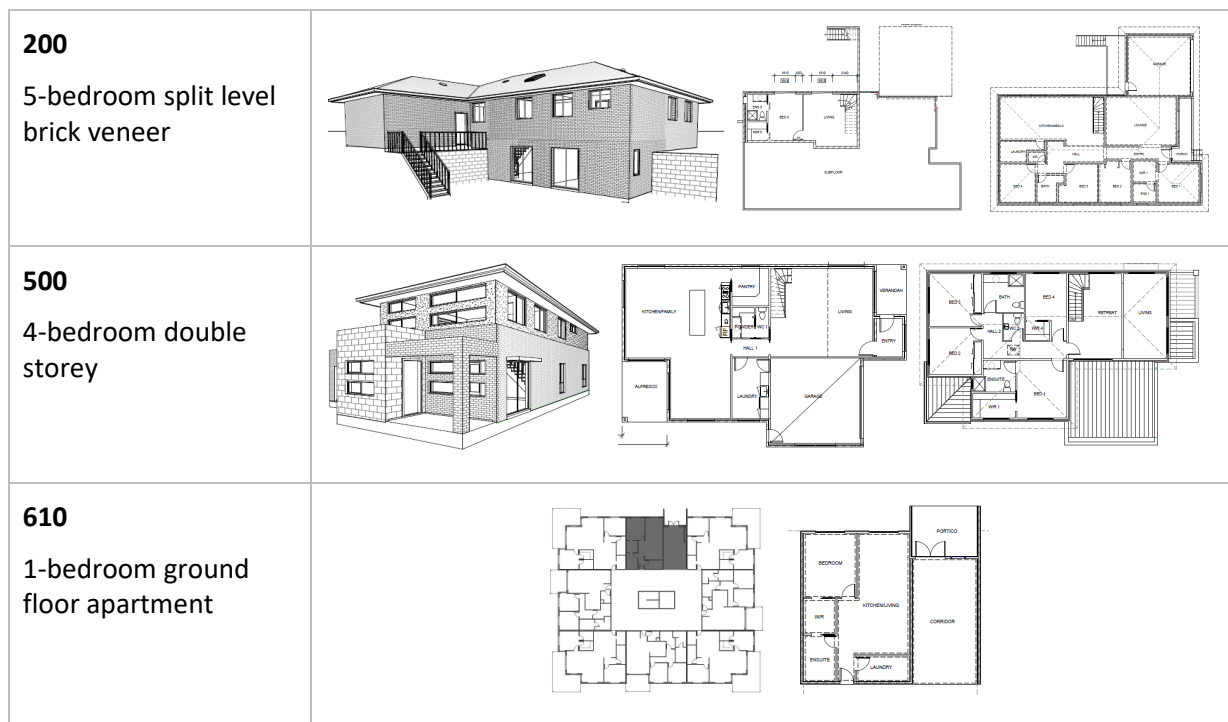
Figure 2 — NatHERS test dwelling designs

The SAP dwellings designs used in WoH testing include two Class 1 and one Class 2 (Figure 2) designs. New accreditation and reaccreditation entails modelling all three dwellings, whereas minor updates are generally limited to two designs depending on what features are being updated. Dwelling design features are available from the Administrator.